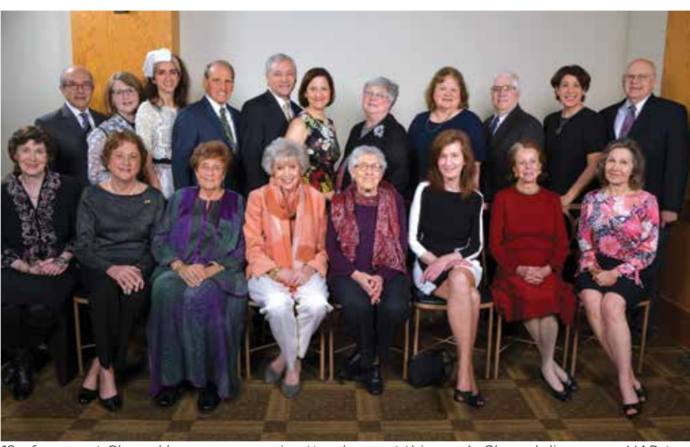
19 of our past Chesed honorees were in attendance at this year's Chesed dinner...we HAD to get a photo!