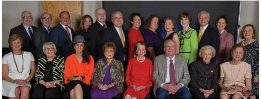
22 of JFS's past Chessed honorees