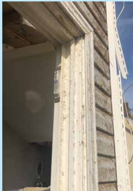
Mezuzah still intact