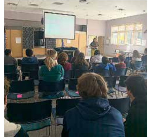
Teens participating in workshop