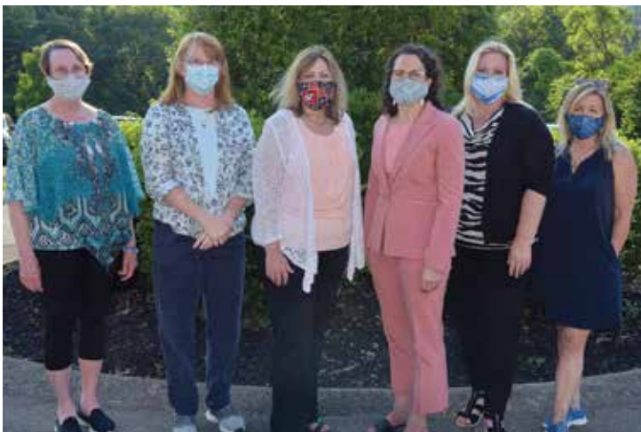
JFS Staff, Ruach Award recipient 2020