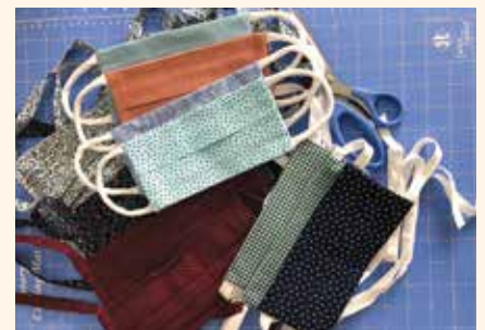
Some of the masks sewn by our volunteers

“2020 has shown us that our connections with each other are what will ultimately help us all in coping with this experience.”