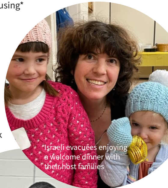
Israeli evacuees enjoying a welcome dinner with their host families