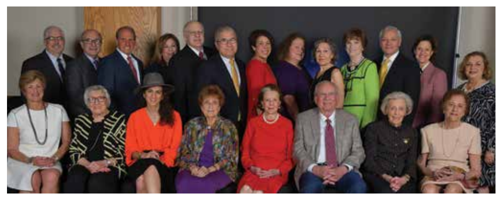
22 of JFS's past Chesed honorees